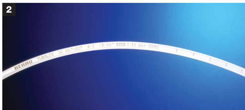
Example of article 049402 001: REHAU TUBALCO SK 017-027 4/2 (5/16" ID) 11 bar 0242 1 1 1 1 1

REHAU will not accept any guarantees that go over and above this.