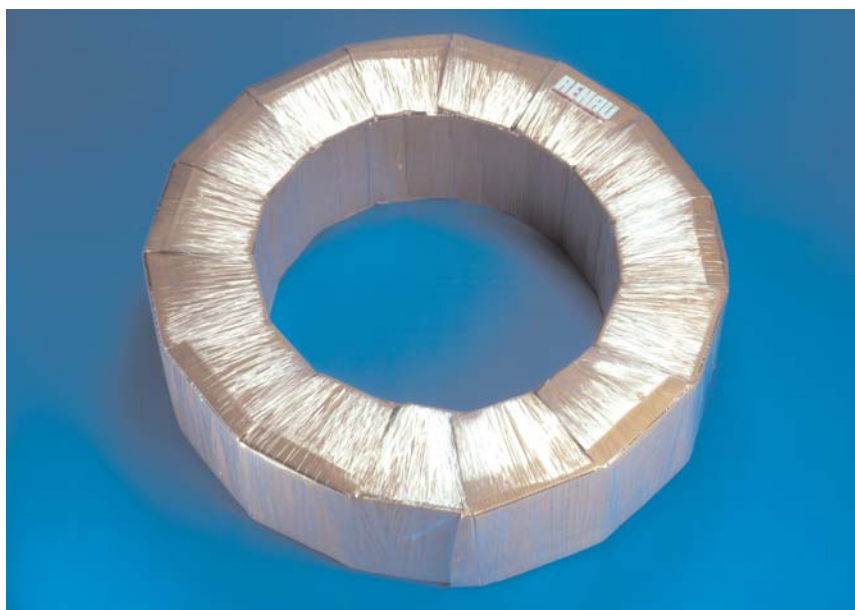
REHAU python packaging