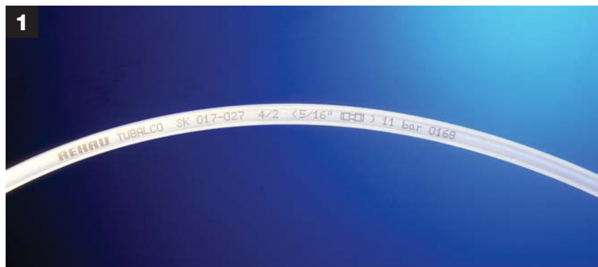
Example of article 049402 001: REHAU TUBALCO SK 017-027 4/2 (5/16" ID) 11 bar 0169

REHAU's guarantee is restricted to series delivery in line with specification and based on the technical delivery specification (TLV), with reference to the product range brochure T23.200 with relevant current status and on the basis of the REHAU conditions of sale.